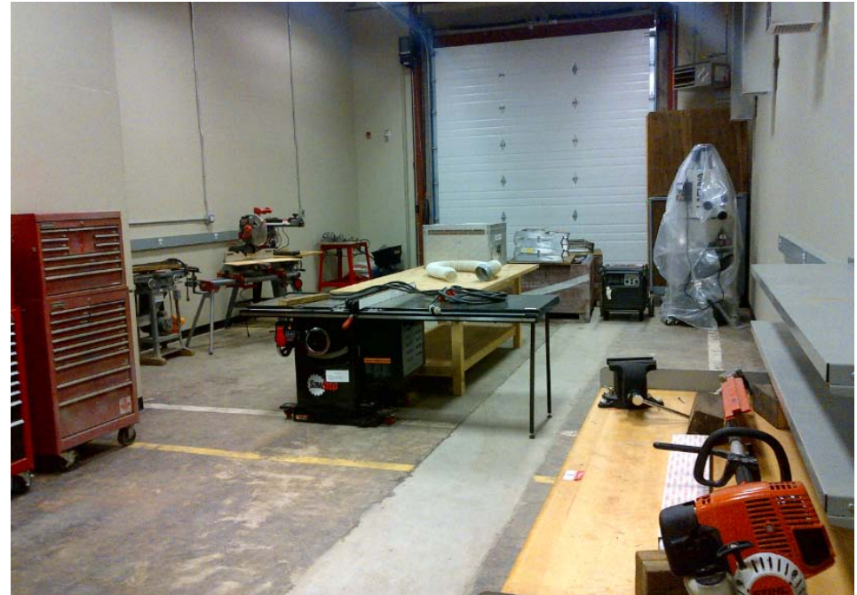
Staff training and meeting centre, and one of the work shops.