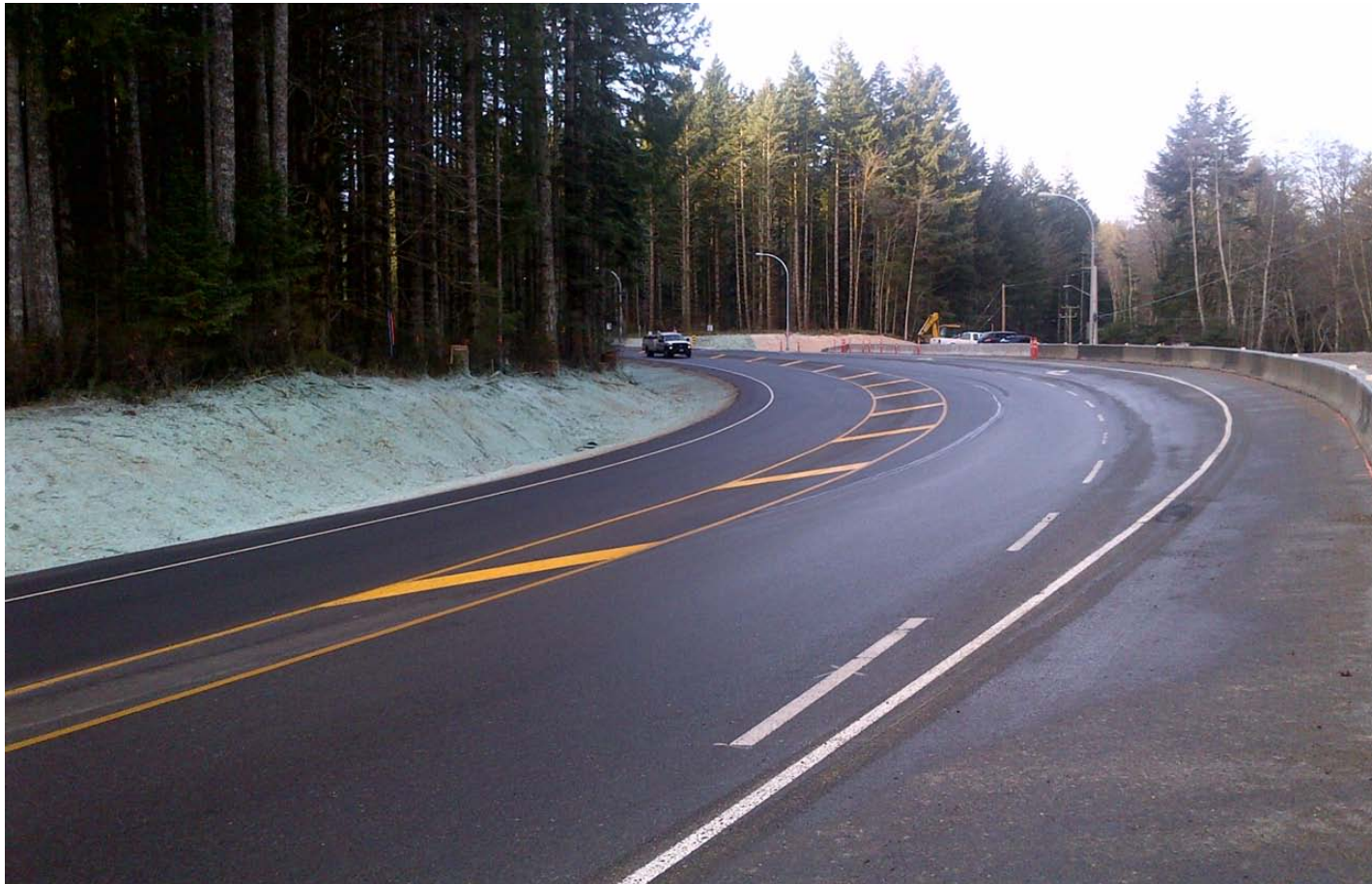
Looking southwest on Hwy 28 towards Powerhouse Rd intersection.

Powerhouse Road entrance changes: The existing access road into John Hart will be moved and modified for better vehicle safety. Road works completed in November.