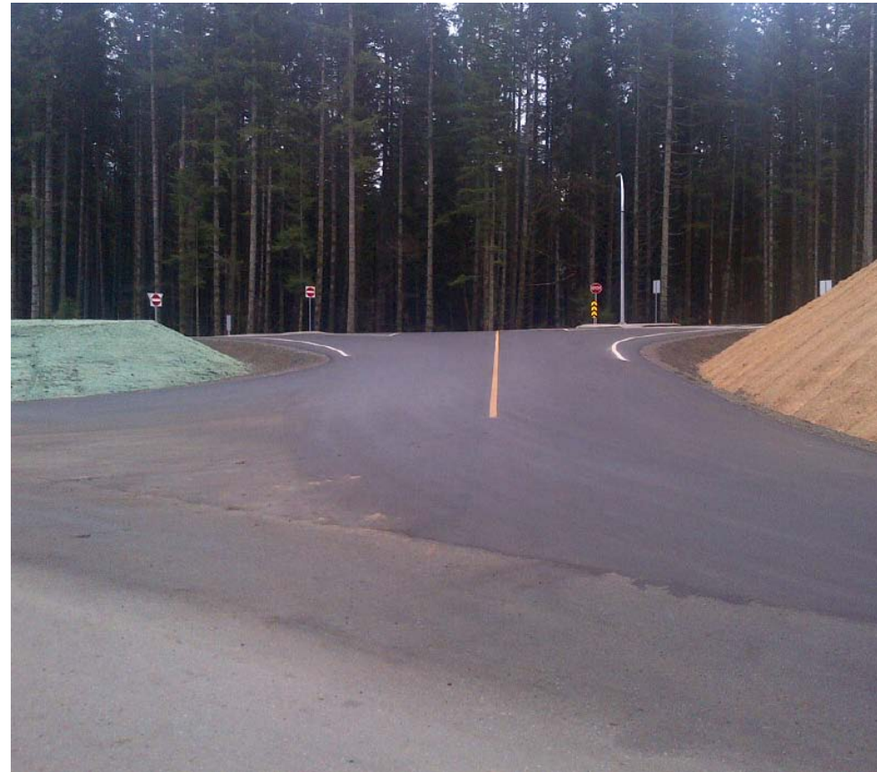
Connecting the street lights, and the view of the access road.