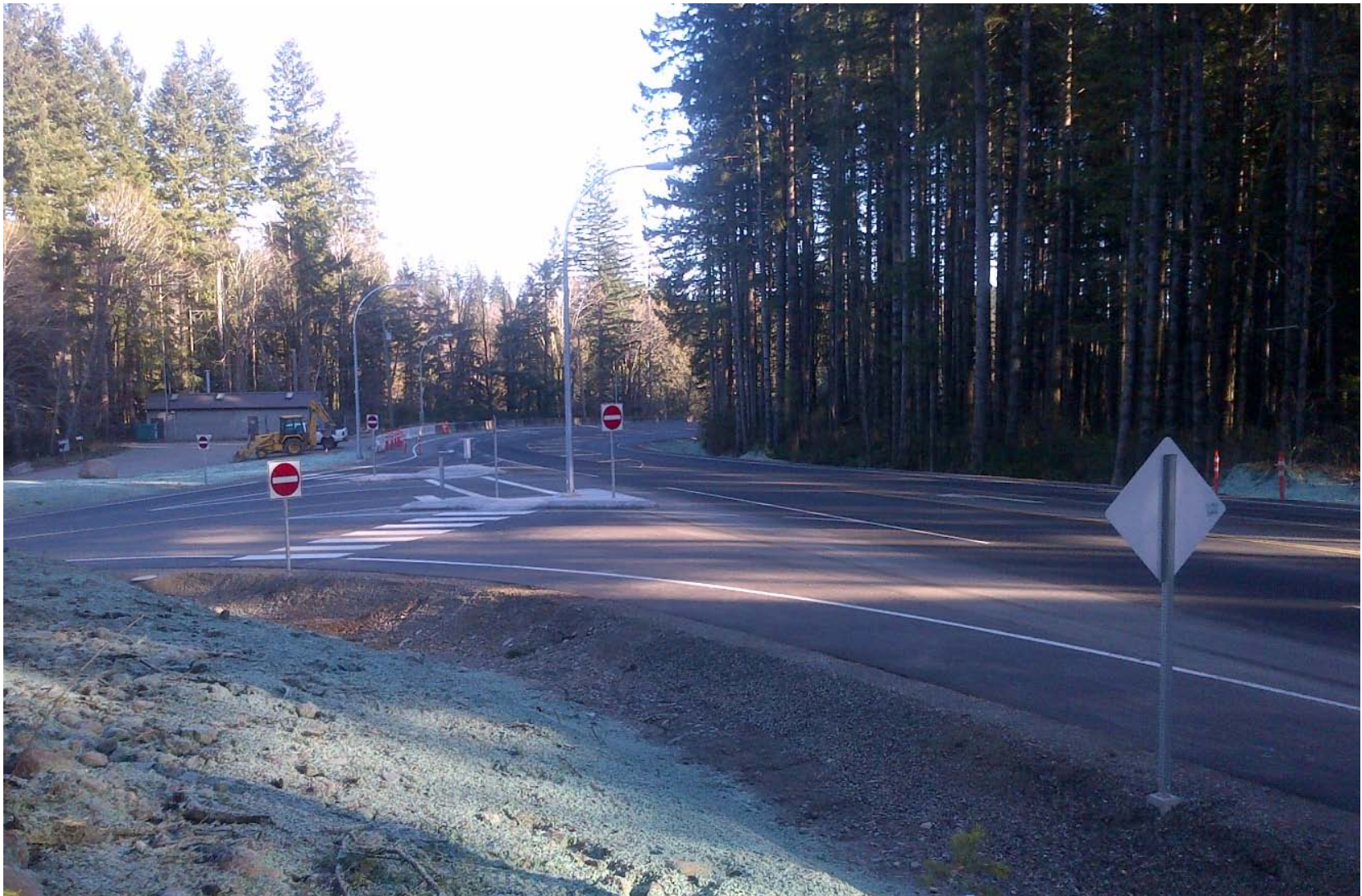
Looking northwest to the intersection