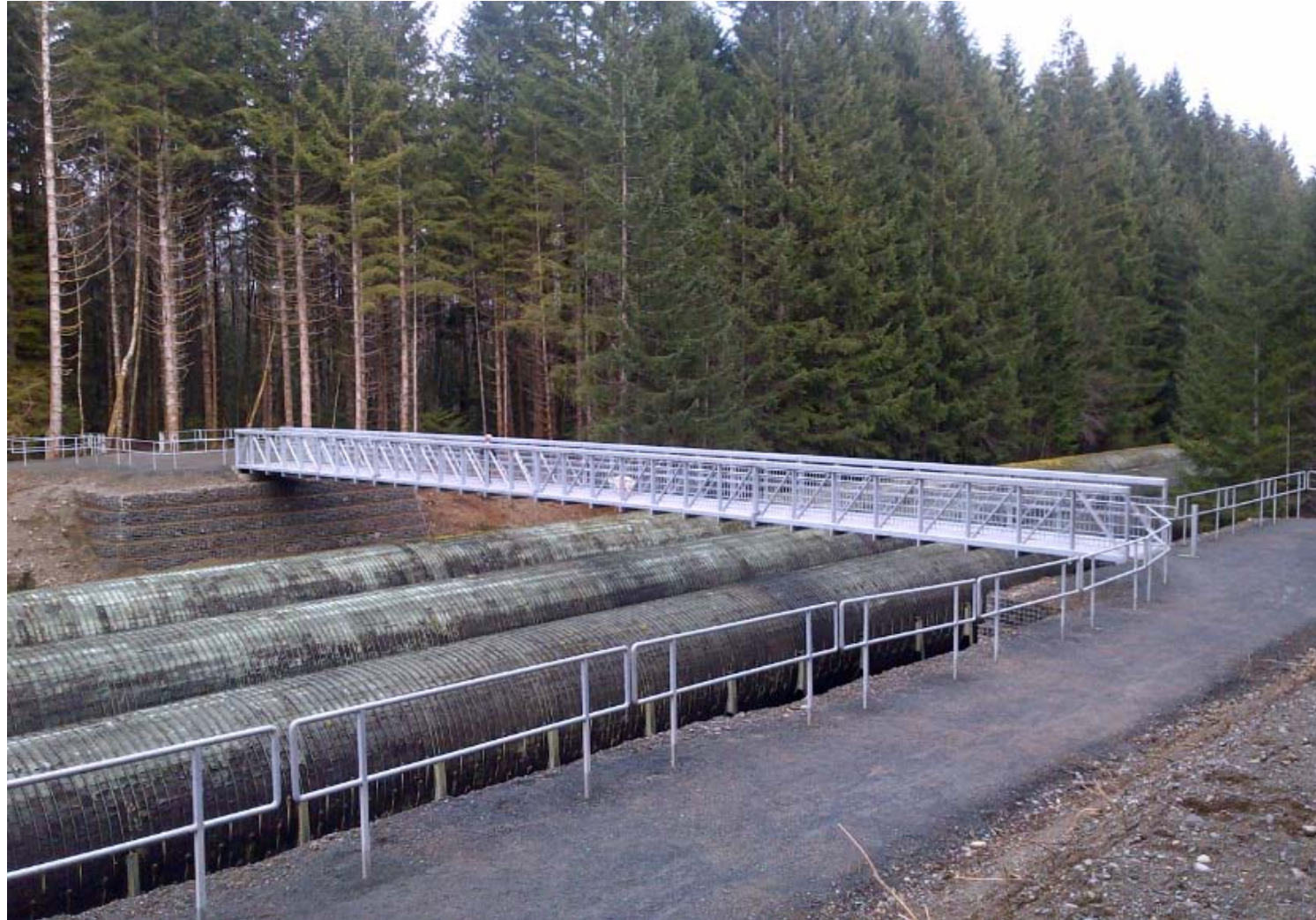
Completed bridge and trail works.