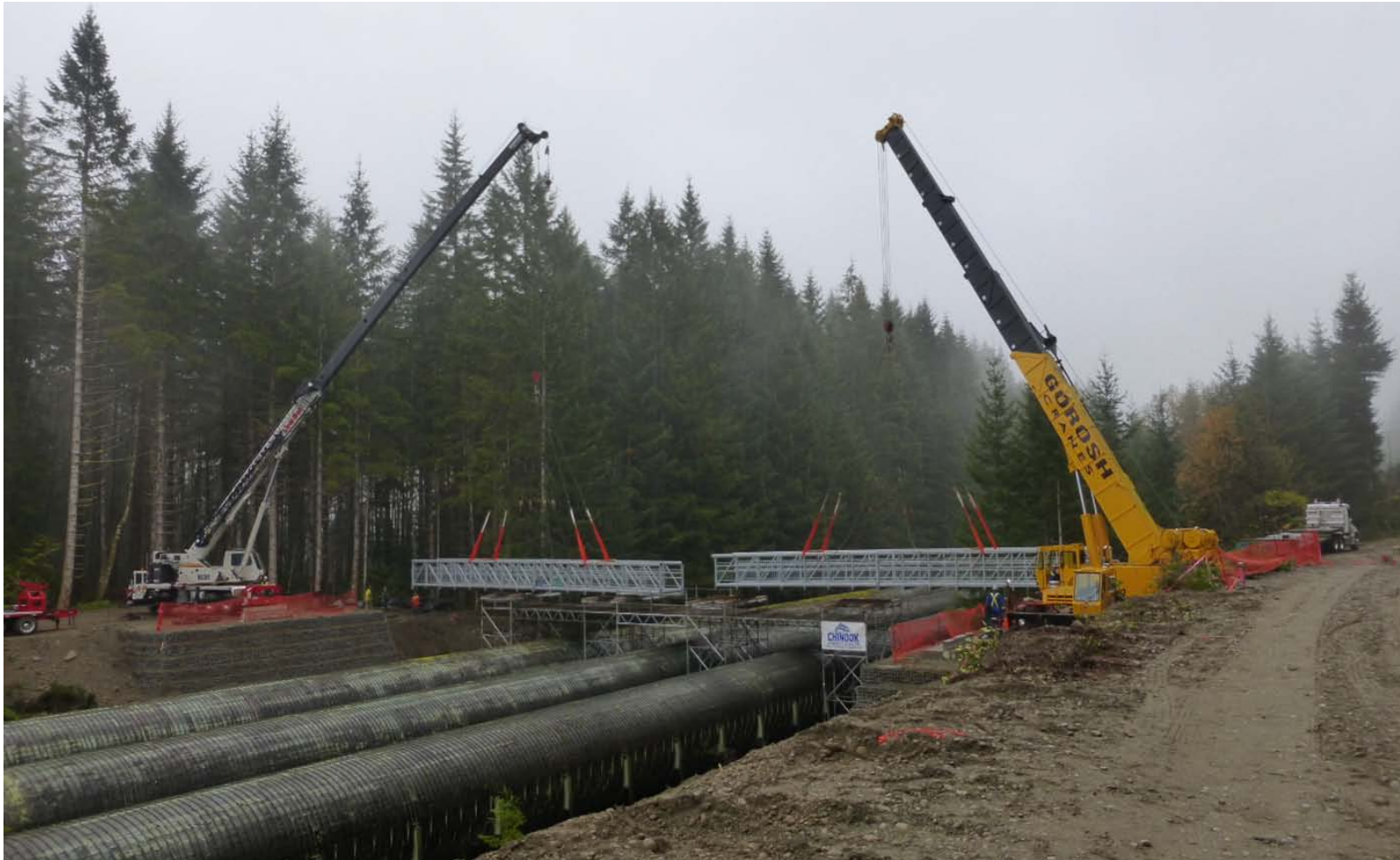
Pedestrian bridge placement – swinging in the two sections onto the scaffolding.

Woodstave Road Works: the new access road, parking lot and trail to the Elk Falls Provincial Park are now complete.