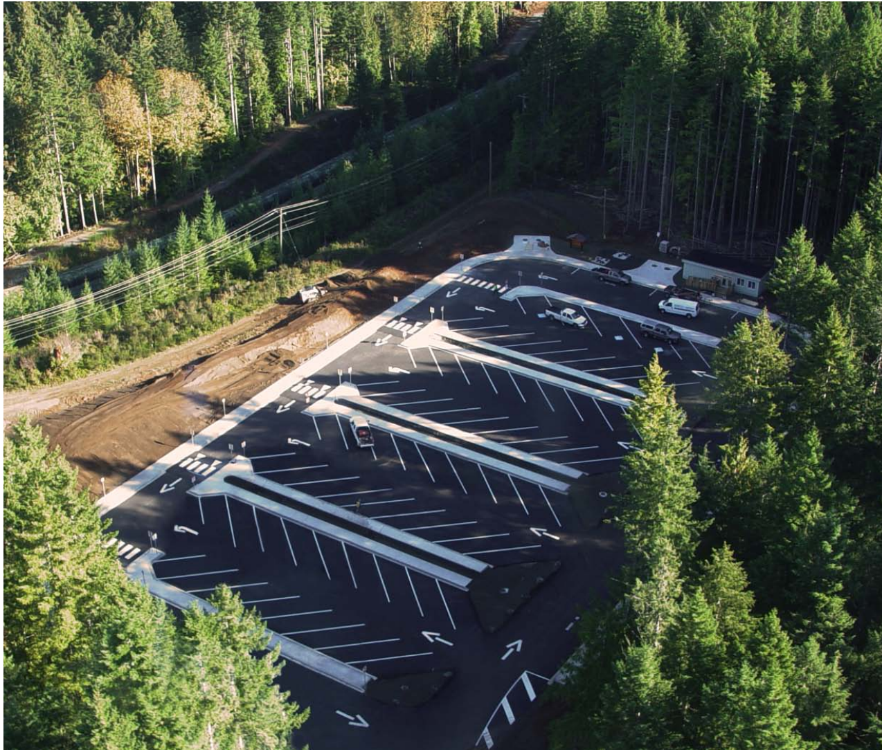
View of parking lot courtesy of our transmission vegetation maintenance crew (thanks to Ray Read). The John Hart pipelines are in the background.