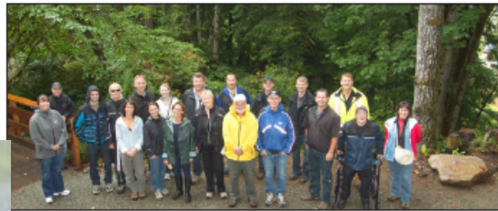
Members of the community planning committee and BC Hydro staff take a break during their opening walk of a new section of the Canyon View Trail.

BC Hydro has just opened up a new section of trail to the Canyon View Trail passing through Hydro John Hart property. The public reaction has been glowing. "I applaud BC Hydro, BC Parks, BC Hydro's Recreation Advisory Committee and everyone involved in the vision and construction of the Station View Trail."