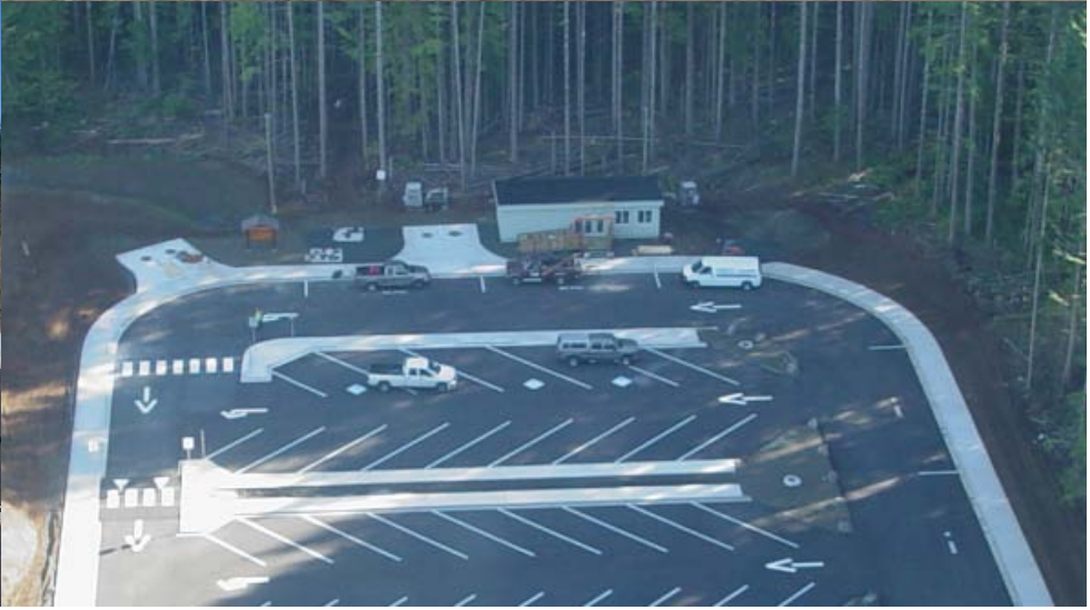
Final touch ups with landscaping, kiosk, garbage and toilet installations.