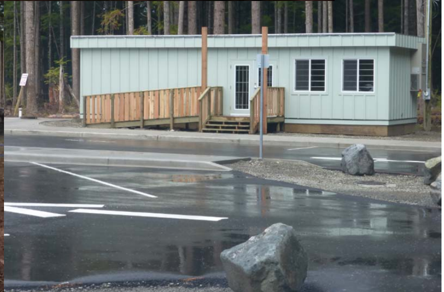
Preparing the John Hart Project Interpretive Centre.