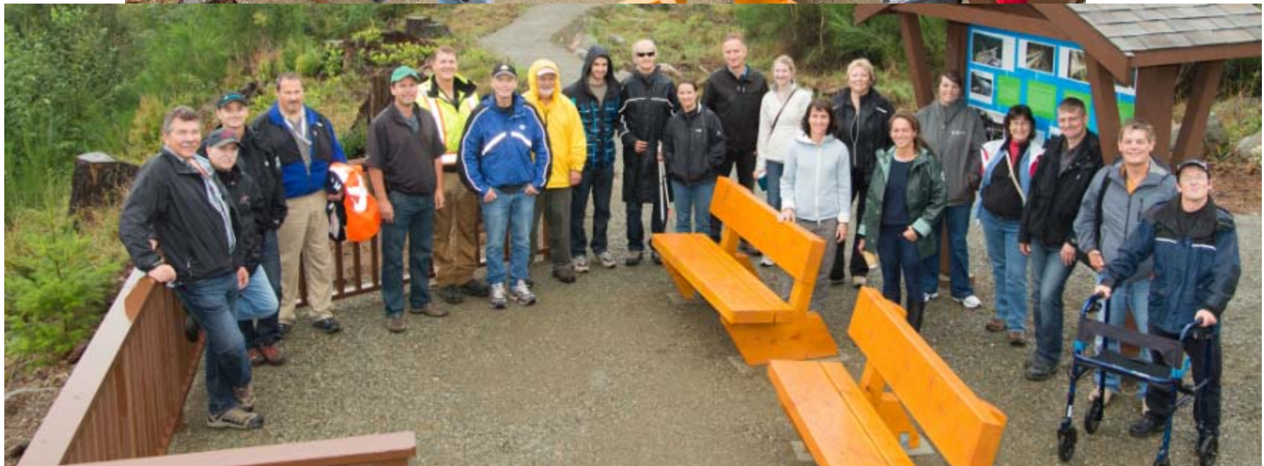
Look out area – grand opening event on August 30.