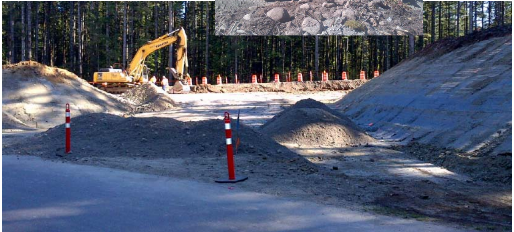
Earthworks on the future access road into John Hart.